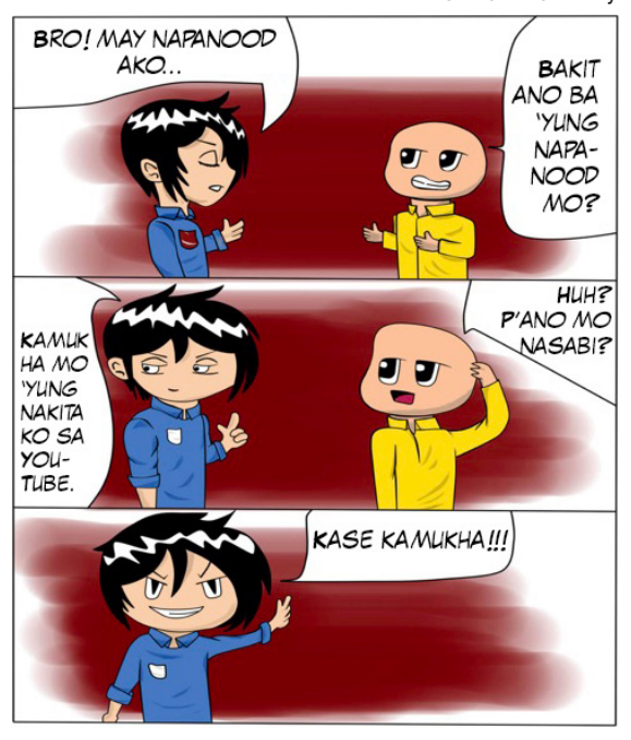
PIKAT By VIC PIDO / AN SULOG